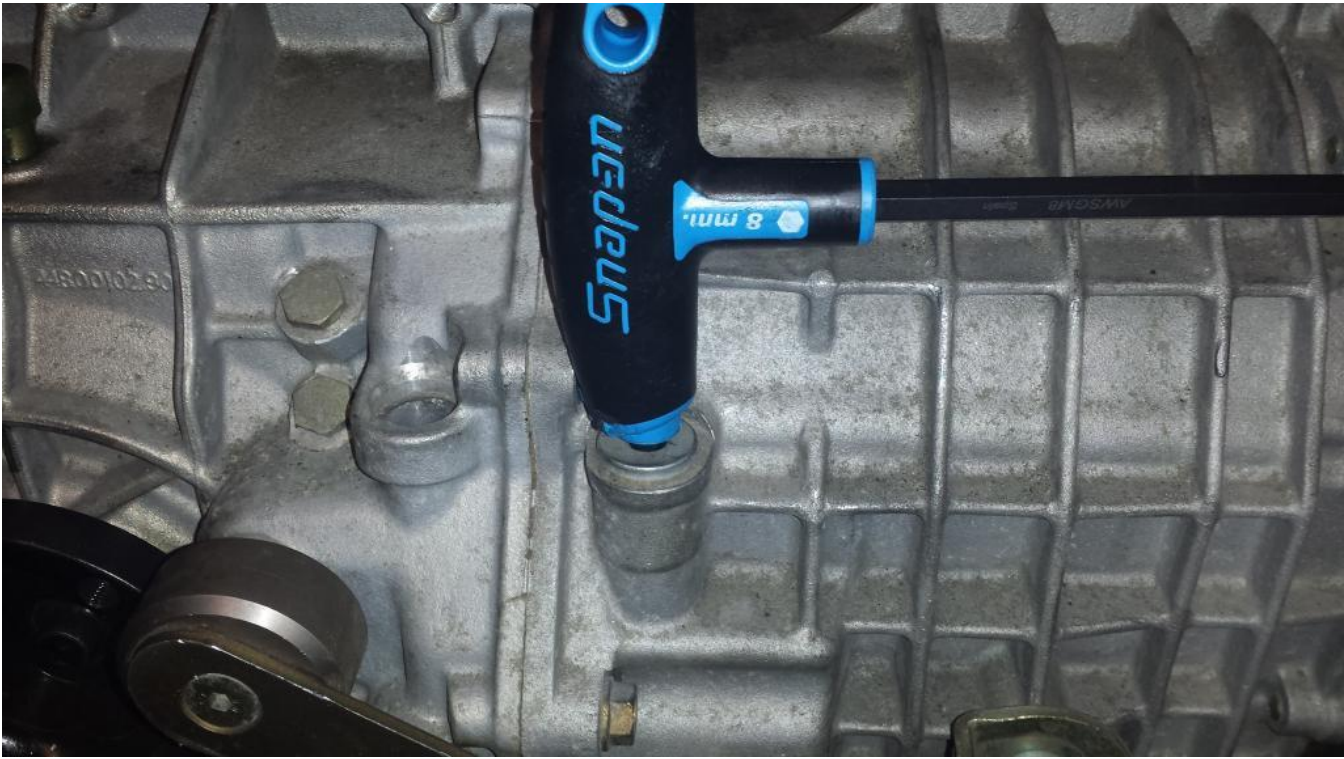
Plug out, clean sealer off.